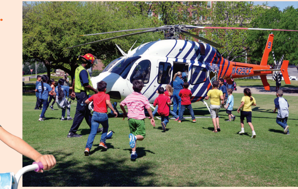
The CareFlite® helicopter landing is always a highlight of Bike Rodeo & Child Safety Day.